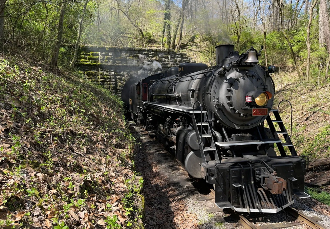
Tennessee Valley Railroad Museum